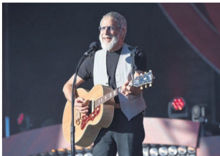
British singer-songwriter Yusuf / Cat Stevens performs at the 2016 Global Citizen Festival in Central Park in New York on Sept. 24, 2016.